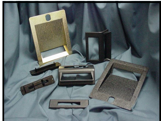
Printer & Bill Entry Bezels

M-C Supply can design and vacuum form or injection mold any plastic part that you may require. Call us with your specifications.