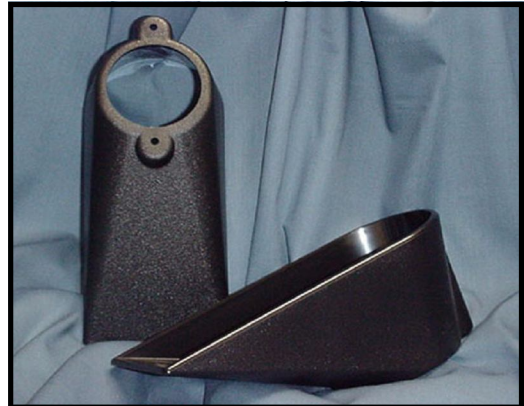
Coin Drop Funnels